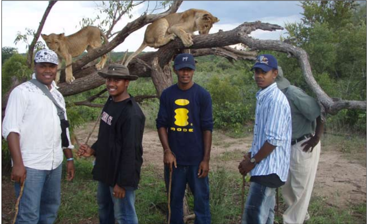
Fijian students on NGF-funded humanitarian tour of Africa