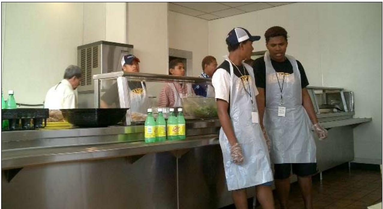
Fijian students volunteer at Homeless Shelter in downtown Los Angeles

A number of mentally and physically handicapped students attend this institution and NGF supplies them with books, games, and tools. NGF has also funded an employment position for a former student of the school who is now able to support his family in this way.