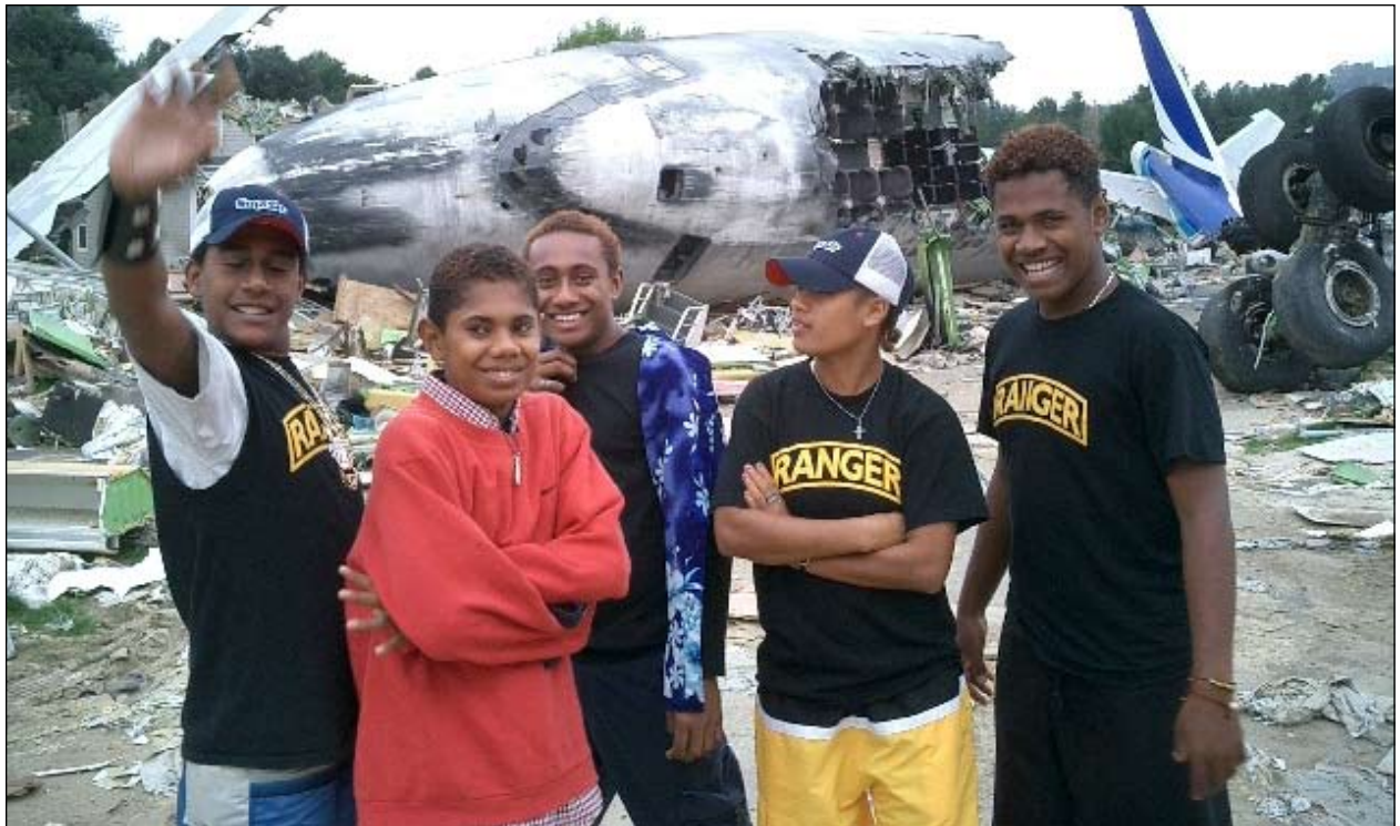
Fijian students on NGF-funded visit to America, on the set of the movie "War of the Worlds"