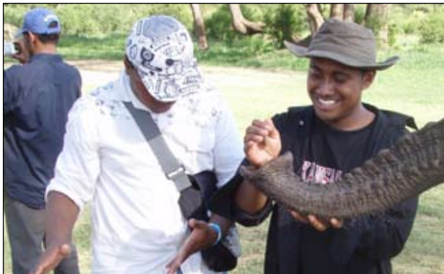
Students during Africa tour