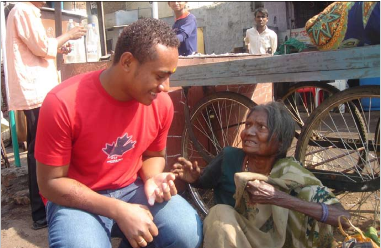
Fijian student on NGF-funded humanitarian tour of India

In April of 2007, NGF provided material for a water collection system on the island of Yanuca. Rain-gutters, pipes, and large storage tanks were donated by NGF, delivered aboard the Tui Tai ship.