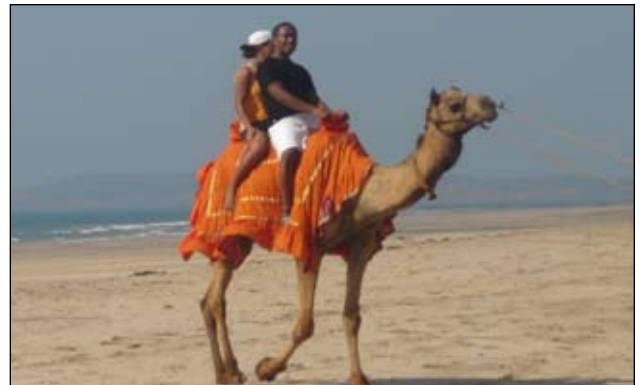
Fijian students touring India